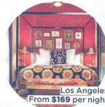
Los Angeles From $169 per night

LOS ANGELES T+Ls Rendez-Vous at the Redbury from the Redbury Hotel (877/962-1717; theredbury.com ), in Hollywood. WHAT'S INCLUDED Two nights in a Sunset Flat; one dinner for two, including wine, at the on-site Cleo; daily breakfast. COST From $518 ($169 per night), double, May 1–June 30. SAVINGS 34 percent.