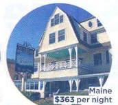
Maine $363 per night

NEW YORK CITY Spring Ahead package at the Setai Fifth Avenue (212/695-4005; setaififthavenue.com ). WHAT'S INCLUDED Two nights in a King room; one $50 credit at the Bar on Fifth; daily breakfast. COST $1,102 ($551 per night), double, May 1–June 30. SAVINGS 20 percent.